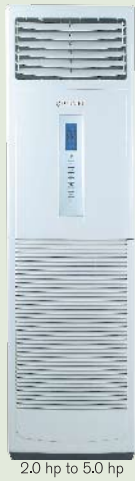
2.0 hp to 5.0 hp

To provide full fresh coolness and circulation to every corner.